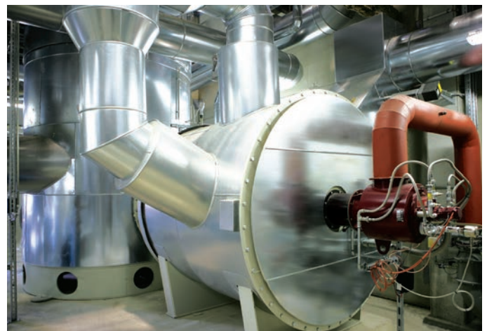
Vertical combustion chamber.